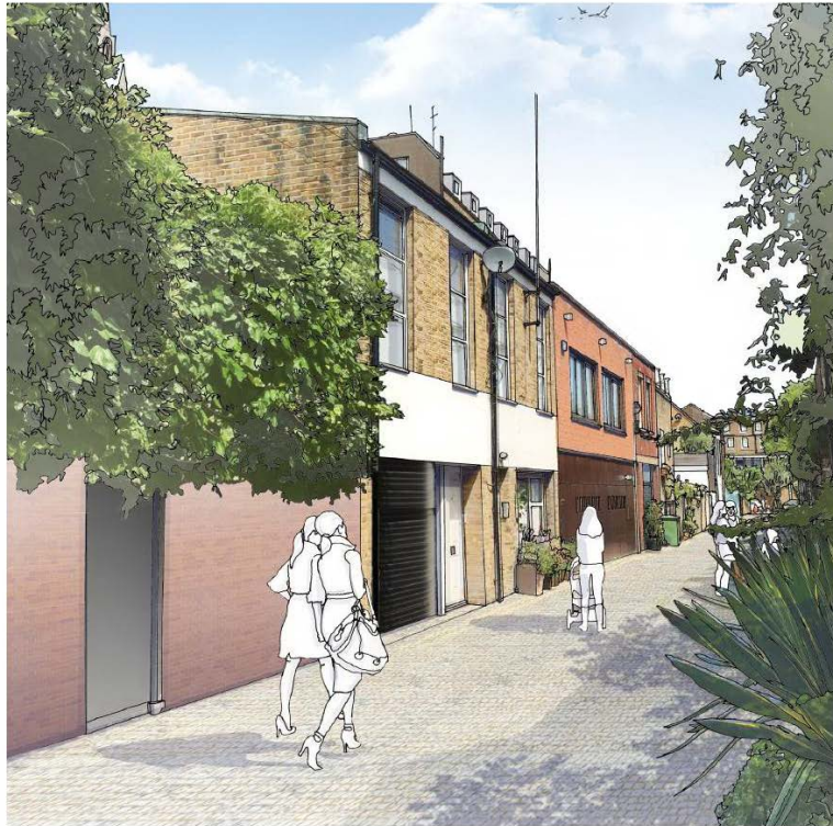
Existing view from St Petersburg Mews looking north

7.5 Perspectives of Existing and Proposed