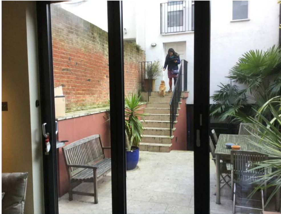
View from first floor of existing mews building looking down to courtyard of 18 St Petersburg Place and No. 20 St Petersburg Place