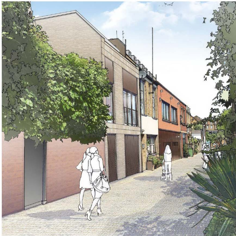
Proposed view from St Petersburg Mews looking north