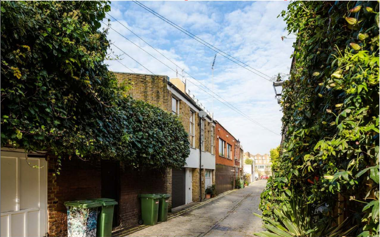
Existing view from St Petersburg Mews looking north