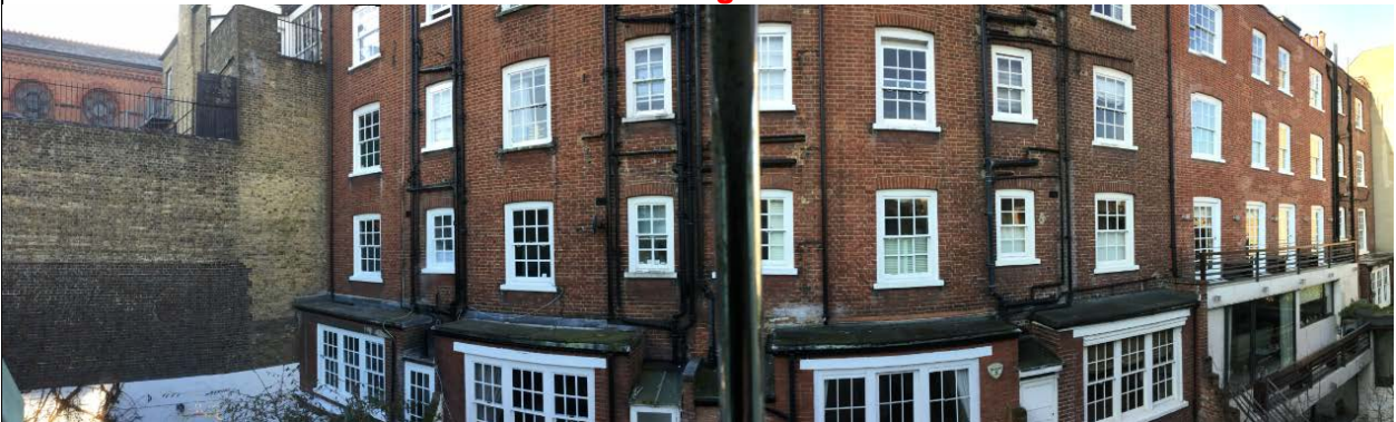
View from rear of 32 St Petersburg Mews looking at rear elevation of 18 St Petersburg Place and neighbours